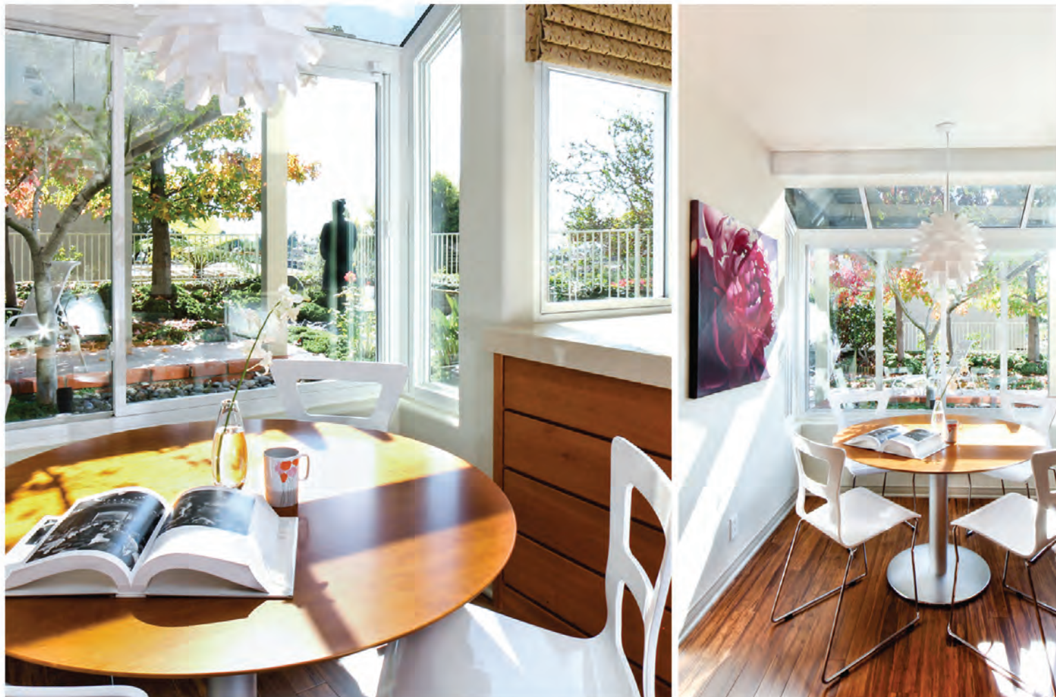
Part of a kitchen remodel for a Del Cerro home, this little breakfast nook now emphasizes simple, neutral, classic and comfy instead of trendy.

A little-used kitchen nook gains stature